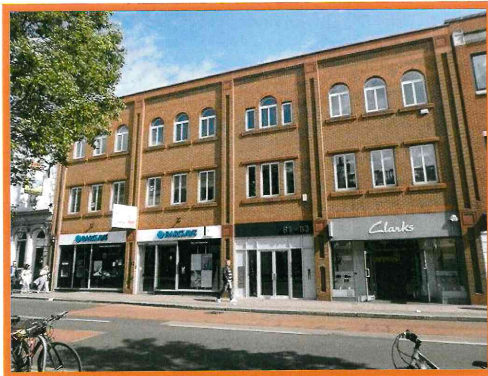
Second Floor Offices, 81-83 Victoria Road, Surbiton, KT6 4NS